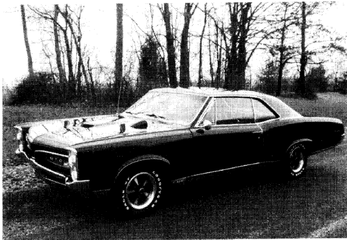
JACK MENKE'S BLACK 1967 GTO HARDTOP